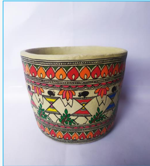
BH05_DD03_MLT SIZE- 7.5" MATERIAL-PAPIER MACHE PRICE-Rs.400/-