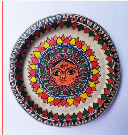
BH05_HP01_MLT SIZE- 11” MATERIAL-PAPIER MACHE PRICE-Rs.400/-