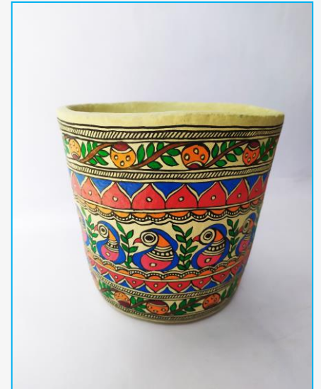
BH05_DD04_MLT SIZE- 7.5" MATERIAL-PAPIER MACHE PRICE-Rs.400/-