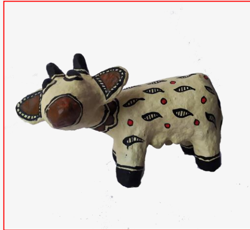
BH05_AT05_COW_WHITE SIZE- 6" MATERIAL-PAPIER MACHE PRICE- Rs.250/-