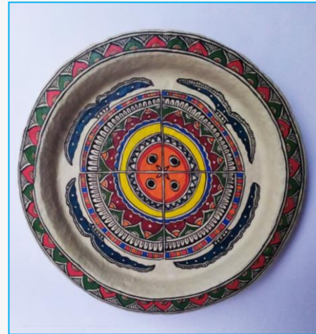
BH05_HP01_MLT SIZE- 11” MATERIAL-PAPIER MACHE PRICE-Rs.400/-