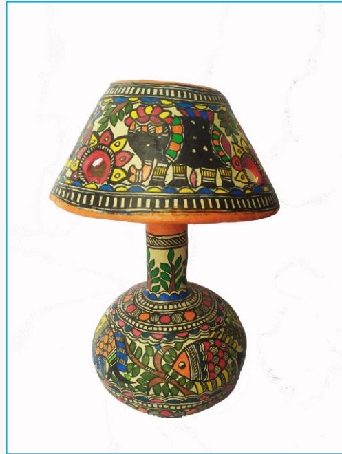
BH05_BSL02_MLT SIZE- 14" MATERIAL-PAPIER MACHE PRICE- Rs.700/-