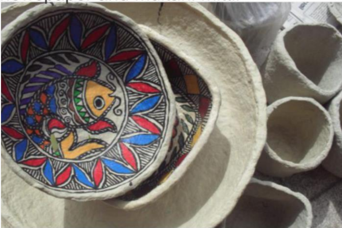
(4) Decoration with the Madhubani style of Painting.