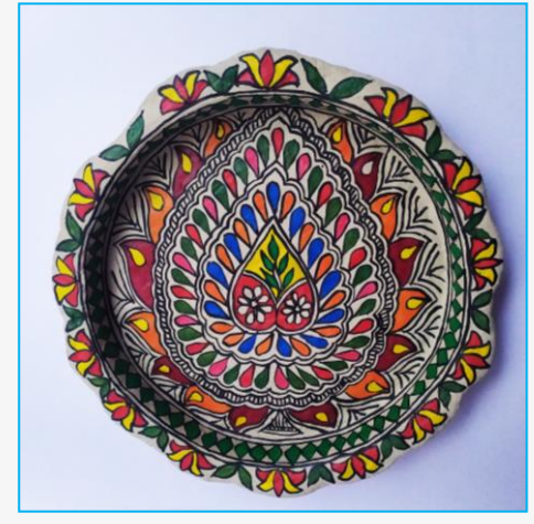
BH05_HP01_MLT SIZE- 11” MATERIAL-PAPIER MACHE PRICE-Rs.400/-