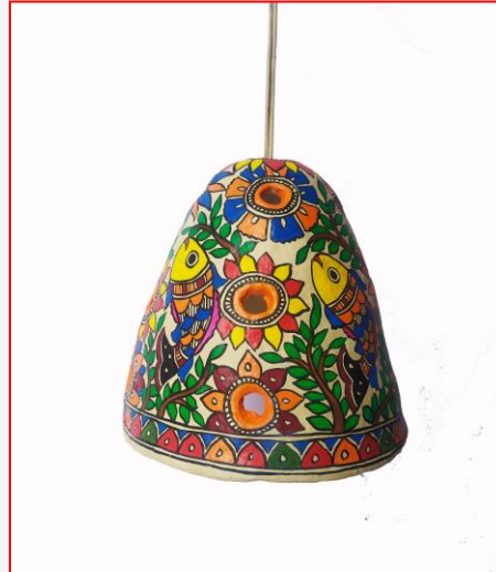
BH05_HL02_MLT SIZE- 8" MATERIAL-PAPIER MACHE PRICE- Rs.300/-