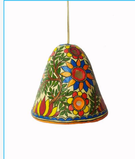
BH05_HL03_MLT SIZE- 8" MATERIAL-PAPIER MACHE PRICE- Rs.300/-