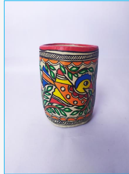
BH05_PS03_MLT SIZE- 4.5"X3.5" MATERIAL-PAPIER MACHE PRICE-Rs. 150/-