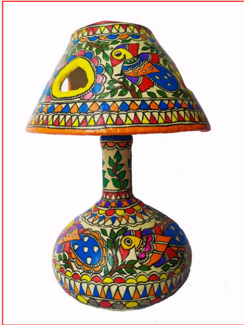
BH05_BSL01_MLT SIZE- 14" MATERIAL-PAPIER MACHE PRICE-Rs.700/-