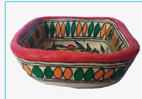
BH05_SB05_MLT SIZE- 5.5" MATERIAL-PAPIER MACHE PRICE- Rs. 200/-