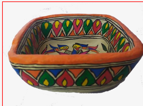
BH05_SB04_MLT SIZE- 5.5" MATERIAL-PAPIER MACHE PRICE- Rs. 200/-