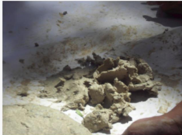
(2) Molding with hands.