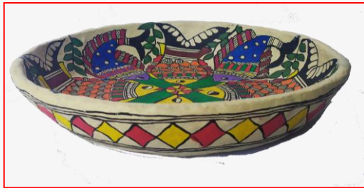
BH05_PR01_MLT SIZE- 13" MATERIAL-PAPIER MACHE PRICE-Rs.400/-