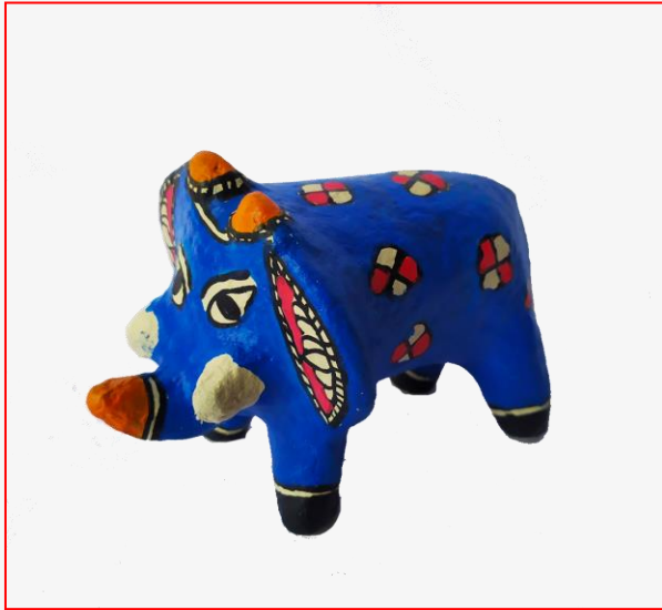
BH05-AT01_ ELPHNT_BLU SIZE- 4" MATERIAL-PAPIER MACHE PRICE-Rs.150/-