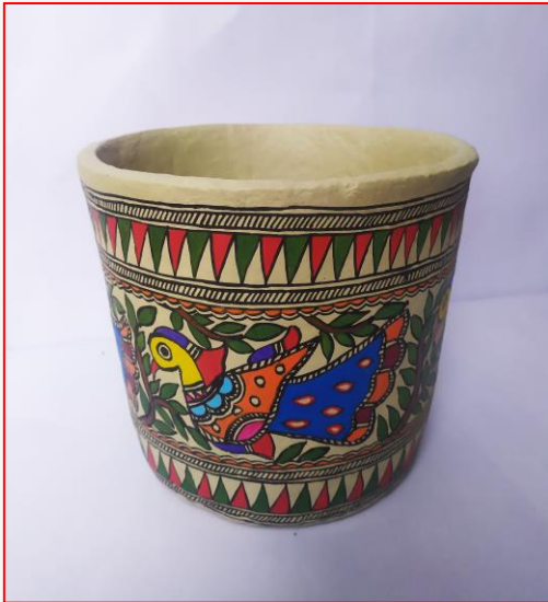
BH05_DD01_MLT SIZE- 7.5" MATERIAL-PAPIER MACHE PRICE-Rs.400/-