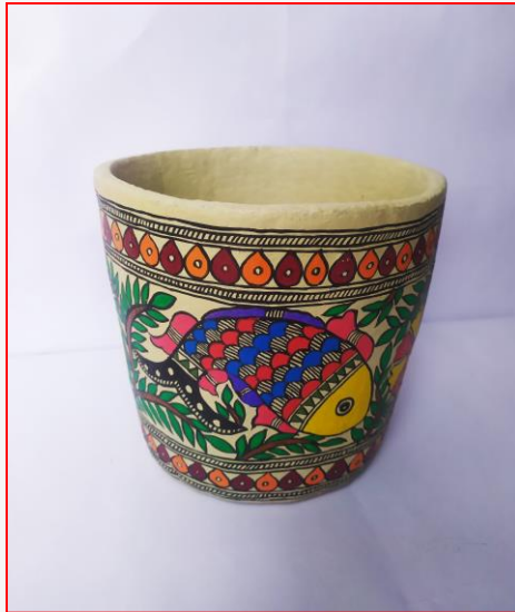
BH05_DD02_MLT SIZE- 7.5" MATERIAL-PAPIER MACHE PRICE-Rs.400/-