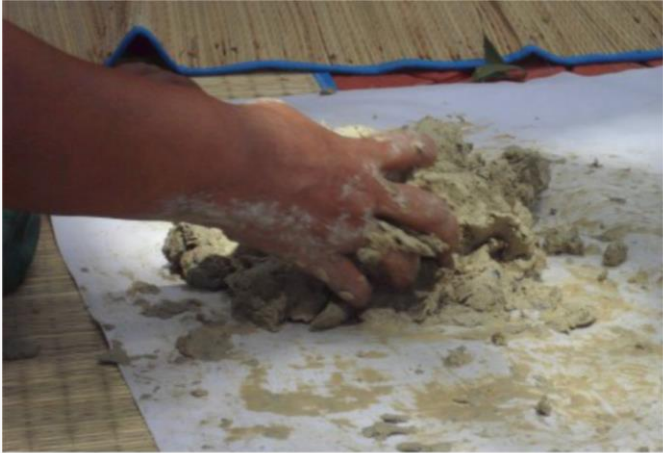
(1) Making paper pulp by soaking newspaper and multani mitti.