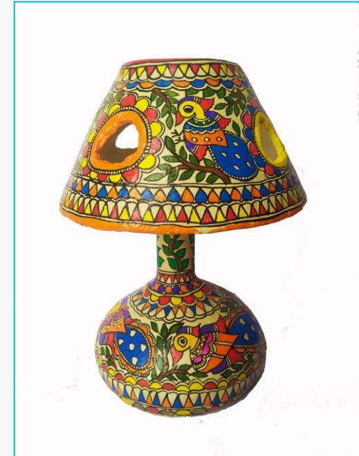
BH05_BSL03_MLT SIZE-14" MATERIAL-PAPIER MACHE PRICE- Rs.700/-