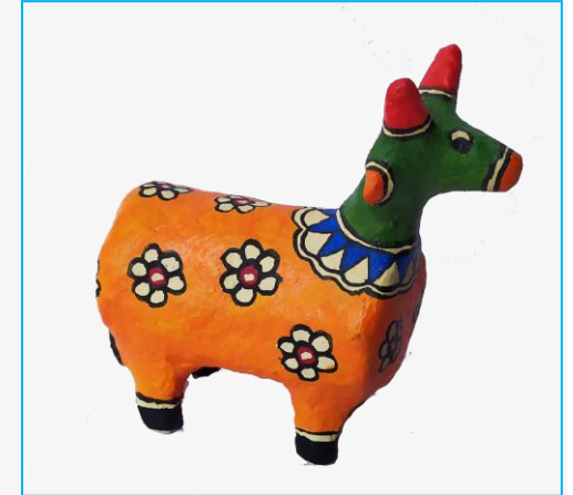
BH05_AT07_COW_ORG SIZE- 6" MATERIAL-PAPIER MACHE PRICE- Rs.250/-