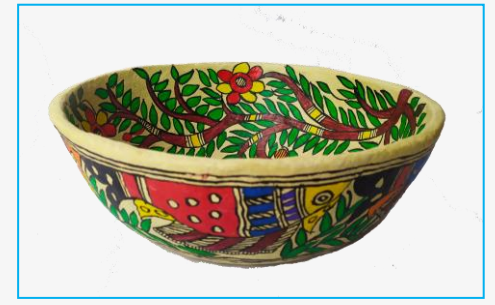
BH05_RB09_MLT SIZE- 11" MATERIAL-PAPIER MACHE PRICE-Rs.400/-