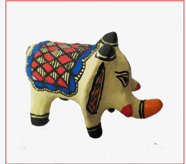
BH05_AT03_ ELPHNT_WHITE SIZE- 4" MATERIAL-PAPIER MACHE PRICE- Rs.150/-