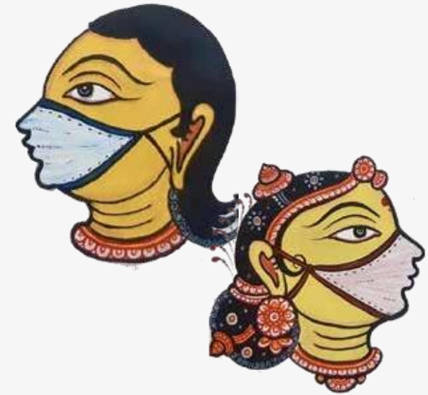
(Apindra Swain's art shows mythological figures wearing facemasks)

#CreativeDignity is an unprecedented national movement of India's leading artisan skill-based development organisations and master artisans in response to the devastating effects of the Covid 19 pandemic on millions of rural artisan manufacturers across India.