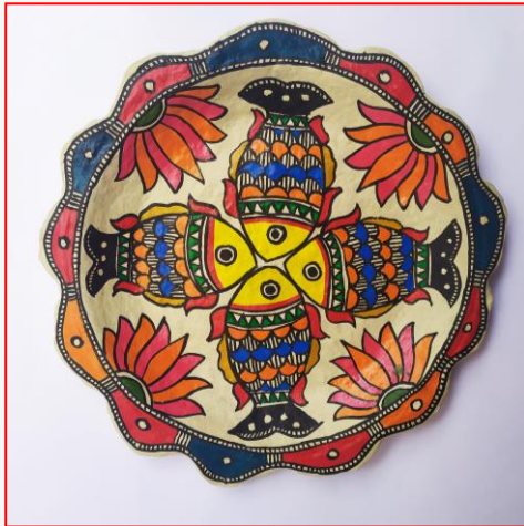
BH05_HP01_MLT SIZE- 8.5” MATERIAL-PAPIER MACHE PRICE-Rs.200/-