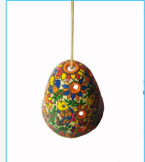
BH05_HL04_MLT SIZE- 8" MATERIAL-PAPIER MACHE PRICE- Rs.300/-