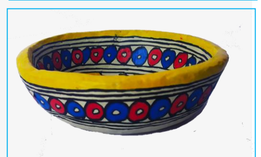
BH05_RB01_MLT SIZE- 6" MATERIAL-PAPIER MACHE PRICE-Rs.200/-