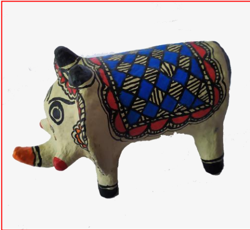
BH05_AT04_ELPHNT_BLU SIZE- 6" MATERIAL-PAPIER MACHE PRICE-Rs.250/-