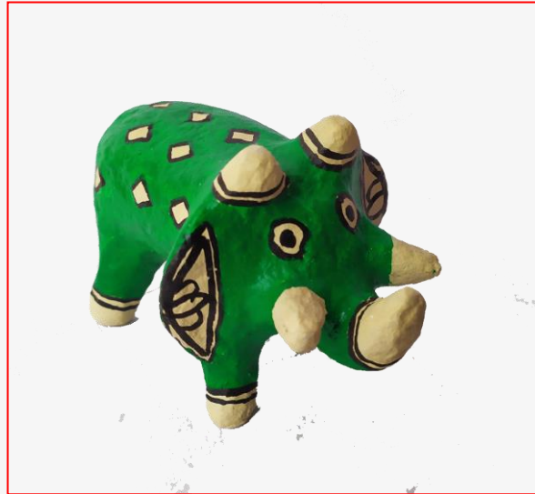
BH05_AT02_ ELPHNT_GREEN SIZE- 4" MATERIAL-PAPIER MACHE PRICE- Rs.150/-