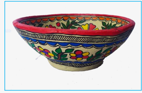
BH05_RB05_MLT SIZE- 6" MATERIAL-PAPIER MACHE PRICE- Rs.200/-