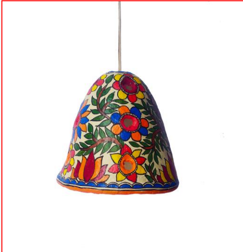
BH05_HL01_MLT SIZE- 8" MATERIAL-PAPIER MACHE PRICE-Rs.300/-