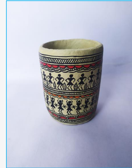
BH05_PS04_WHITE SIZE- 4.5"X3.5" MATERIAL-PAPIER MACHE PRICE-Rs. 150/-