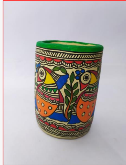
BH05_PS02_MLT SIZE-4.5"X3.5" MATERIAL-PAPIER MACHE PRICE-Rs. 150/-