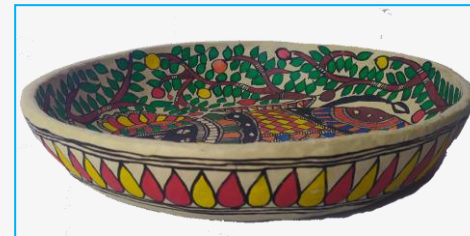
BH05_PR02_MLT SIZE- 13" MATERIAL-PAPIER MACHE PRICE- Rs.400/-