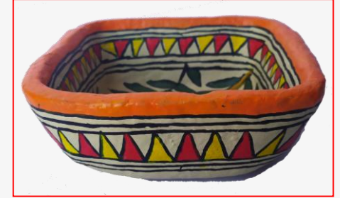
BH05_SB01_MLT SIZE- 5.5" MATERIAL-PAPIER MACHE PRICE- Rs. 200/-