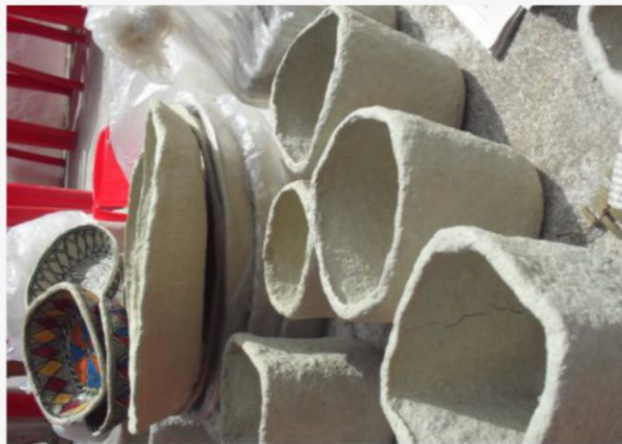
(3) Drying the objects.