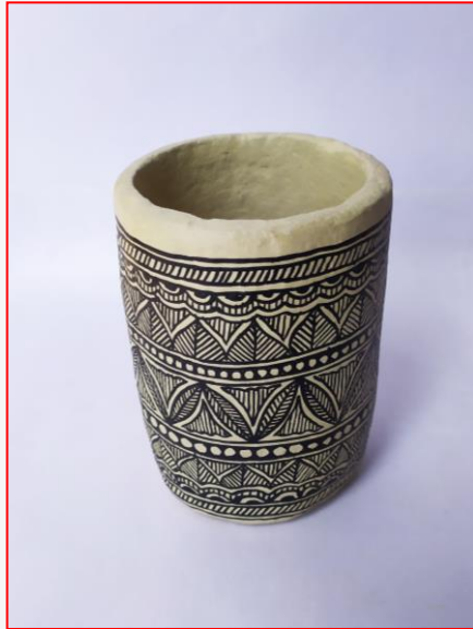
BH05_PS01_WHITE SIZE- 4.5"X3.5" MATERIAL-PAPIER MACHE PRICE-Rs.150/-