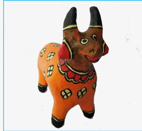
BH05_AT06_DEER_ORG SIZE- 6" MATERIAL-PAPIER MACHE PRICE- Rs.250/-