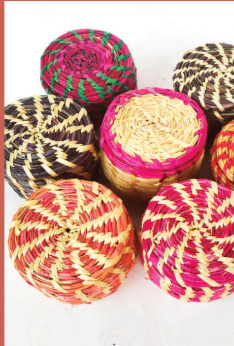
POTS, PLATES & BOXES