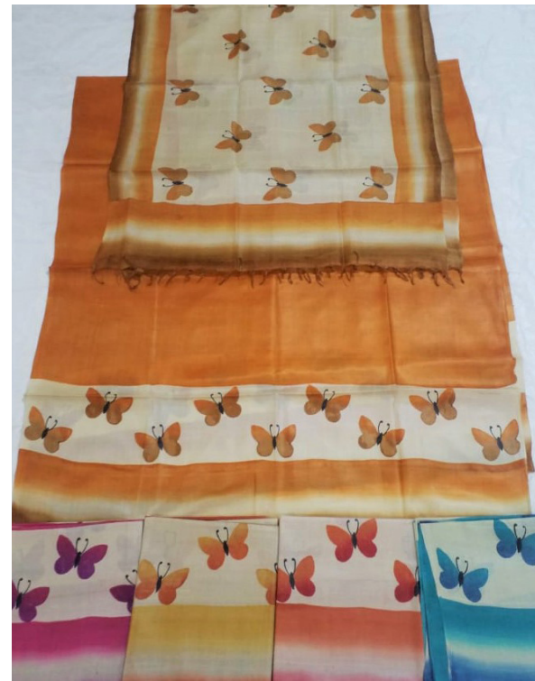
TASSAR SILK SUIT WITH DUPATTA PRICE-4750