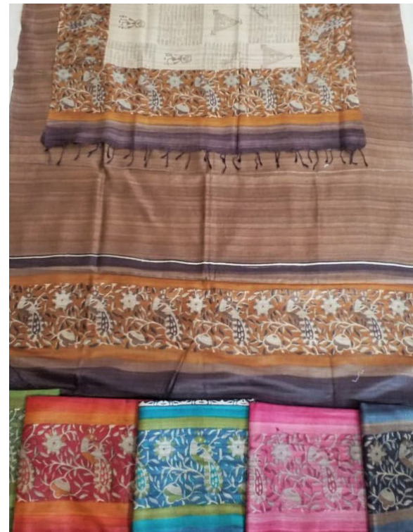
TASSAR SILK SUIT WITH DUPATTA PRICE-4750