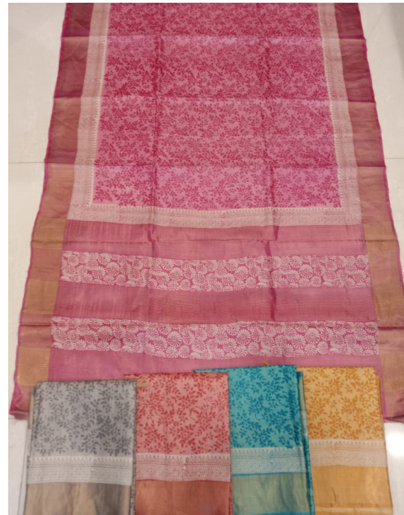
TASSAR SILK SAREE WITH BLOUSE PRICE-5250