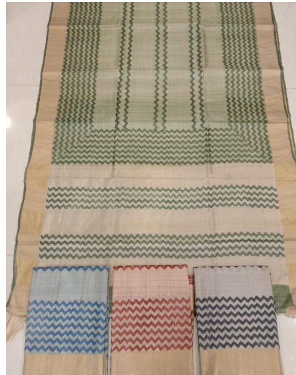
TASSAR SILK SAREE WITH BLOUSE PRICE-5250