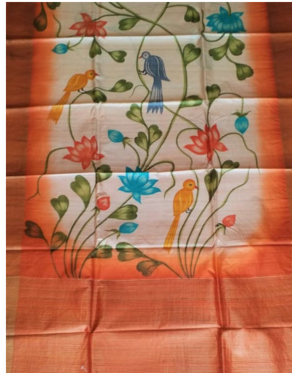
HAND PAINTED TASSAR SILK SAREE WITH BLOUSE PRICE-8000