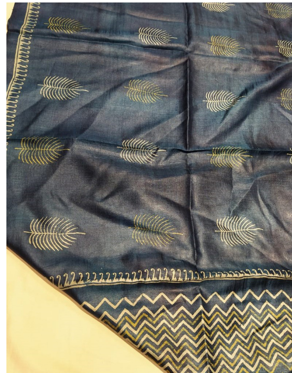
TASSAR SILK HAND BLOCK PRINTED DUPATTA PRICE-2350